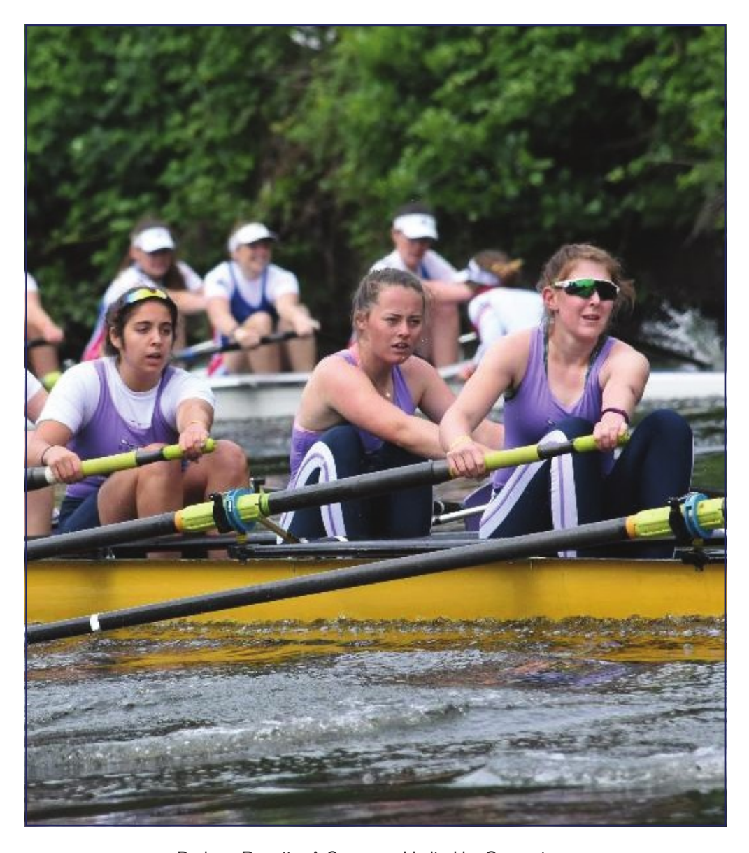
Durham Regatta. A Company Limited by Guarantee. Registered in England No. 07479131 Registered Office: The Clubhouse, Durham Amateur Rowing Club, Green Lane, Durham, DH1 3JU. http://www.durham-regatta.org.uk/